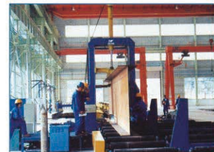
H型钢自动组立机 ( 重型 ) H-beam Auto-assembling Machine (heavy-duty)