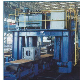
U型组立机 U-type Assembling Machine